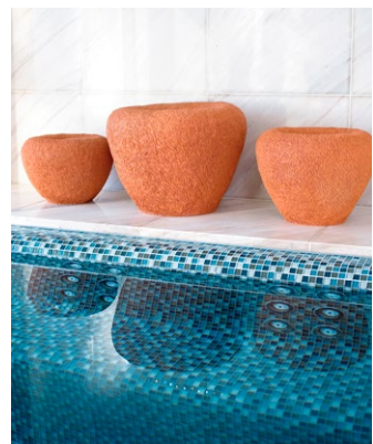
The Spa at Mandarin Oriental, Tokyo offers traditional spa and Signature Therapies, plus beauty treatments and invigorating heat and water experiences. There is also a fully equipped fitness centre.