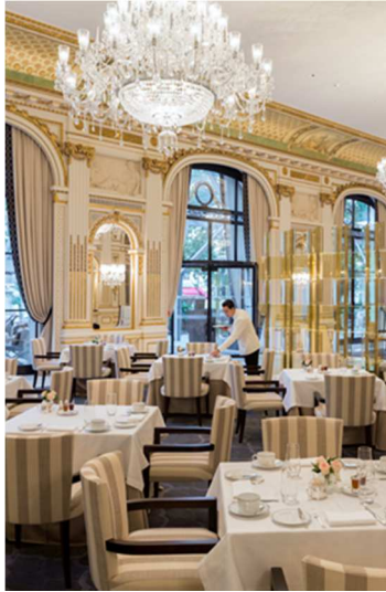
The Lobby Restaurant