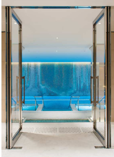
The Peninsula Spa