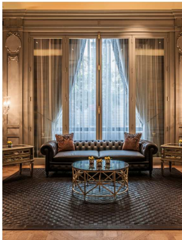
The Lounge Kléber