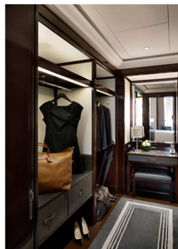
Superior Suite Dressing Room