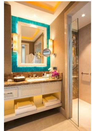
Deluxe Room Bathroom