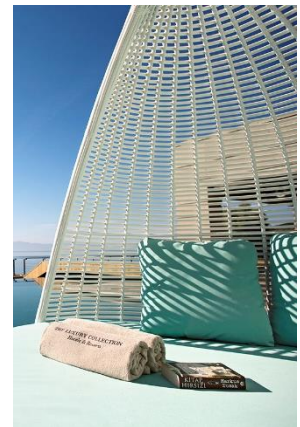
Infinity Pool Daybed

The most ideal location of the top executive board meetings can be provided by our property. Small and mid-scale meetings are provided up to 140 guests. Beach and Deck Weddings and Private Parties can be hold up to 500 guests.