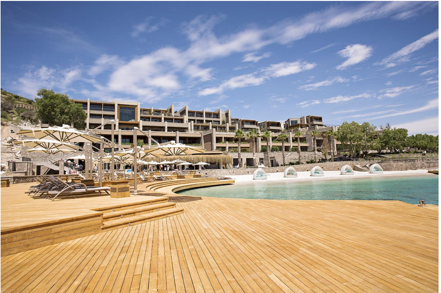
Caresse a Luxury Collection Resort & SPA, Bodrum Deck and Beach