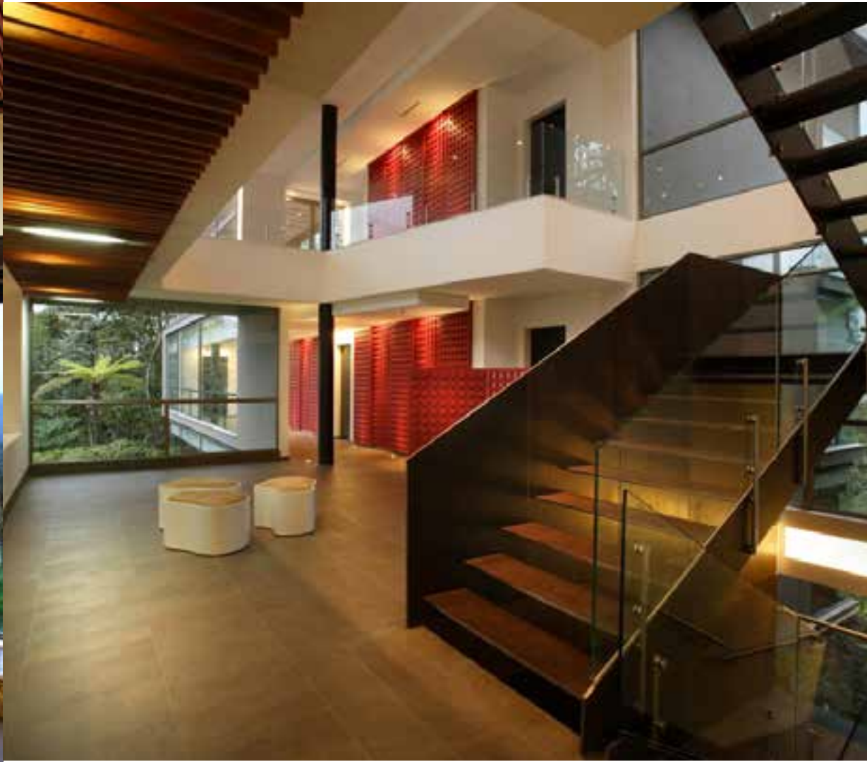
The Lodge is intimate, accommodating a maximum of 44 guests in 22 ample rooms, three of which are suites. For those travelling with friends or family, connecting rooms are available.